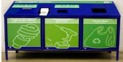
Pictured above – Recycling bin located at Lowe’s Home Improvement for recycling of CFLs, rechargeable batteries and plastic bags.

3RC-EnviroStation. Mercury exposure is very dangerous. Broken bulbs should be cleaned up and disposed of properly. Visit http://www.epa.gov/mercury/spills/index.htm#fluorescent to learn more about the proper disposal. Any time one pound or more of mercury is released into the environment, it is mandatory to call the National Response Center (NRC) . The NRC hotline operates 24 hours a day, 7 days a week. Call 800/424-8802. Note that because mercury is heavy, only two tablespoons of mercury weigh about one pound.