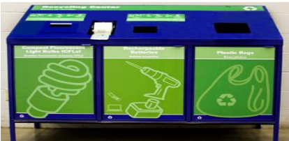
Pictured above – Recycling bin located at Lowe’s Home Improvement for recycling of CFLs, rechargeable batteries and plastic bags.

very dangerous. Broken bulbs should be cleaned up and disposed of properly. Visit http://www.epa.gov/mercury/spills/index.htm#fluorescent to learn more about the proper disposal. Any time one pound or more of mercury is released into the environment, it is mandatory to call the National Response Center (NRC) . The NRC hotline operates 24 hours a day, 7 days a week. Call 800/424-8802. Note that because mercury is heavy, only two tablespoons of mercury weigh about one pound.